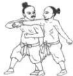
USHIRO EMPI UCHI